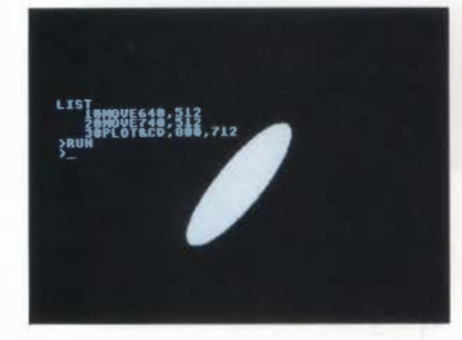
More colours than ever before